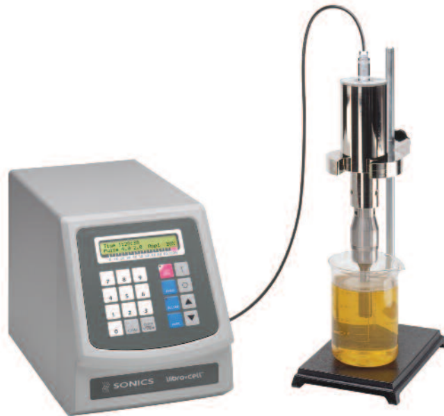
VC 505 – VC 750