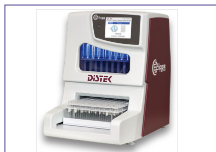
Eclipse5300 without Filter Changer