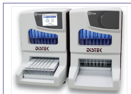
Dual Bath Parent / Child Configuration