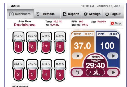
Dashboard screen when wireless in-shaft temperature sensors are Enabled