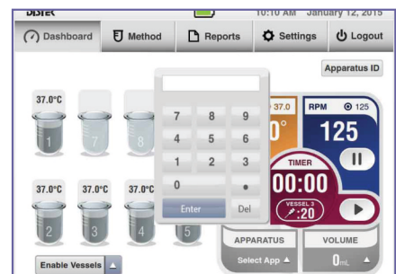
Dashboard screen with Volume Set