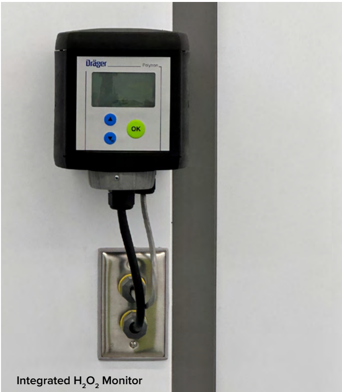
Integrated H 2 O 2 Monitor