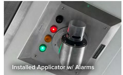
Installed Applicator w/ Alarms