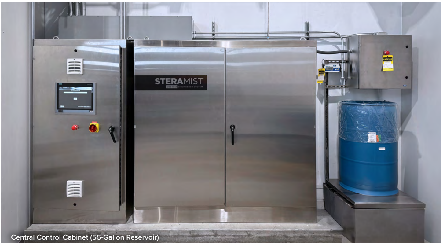
Central Control Cabinet (55-Gallon Reservoir)