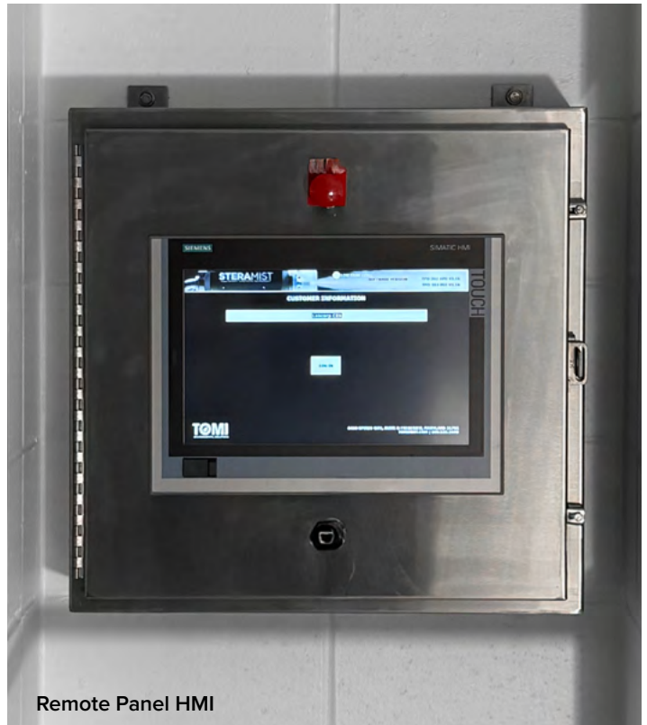
Remote Panel HMI