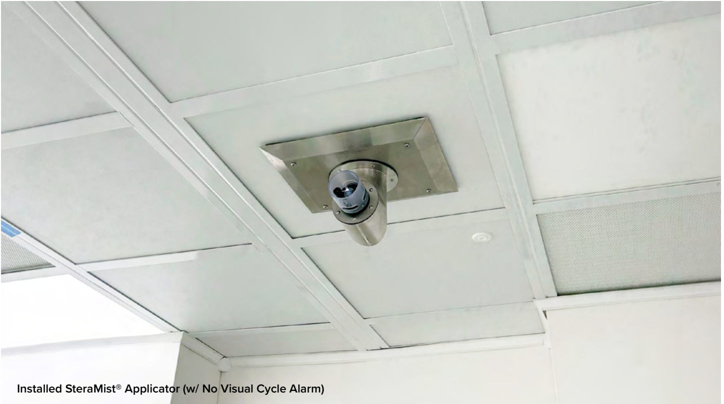
Installed Steramist® Applicator (w/ No Visual Cycle Alarm)

Dana Farber Cancer Institute, Research Core Facilities Director