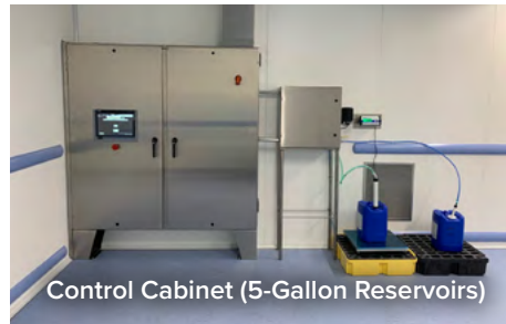
Control Cabinet (5-Gallon Reservoirs)