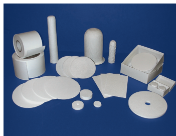
Filters – glass microfiber, cellulose, and membranes

Also available is a full line of high-quality, competitively priced sample preparation products for your QA/QC Laboratory.